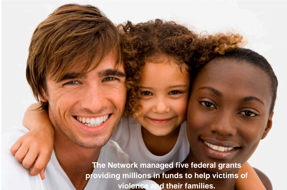
The Network managed five federal grants providing millions in funds to help victims of violence and their families.