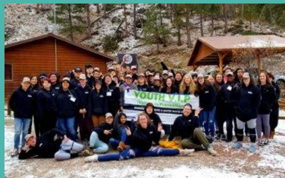
Youth involved in the UNH/CDC grant.