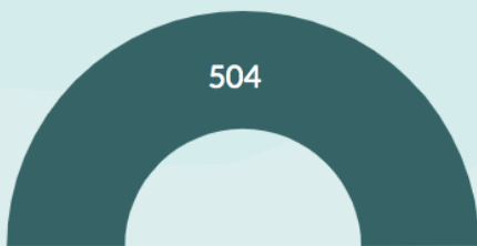
Kits Tested in 2016 Inventory