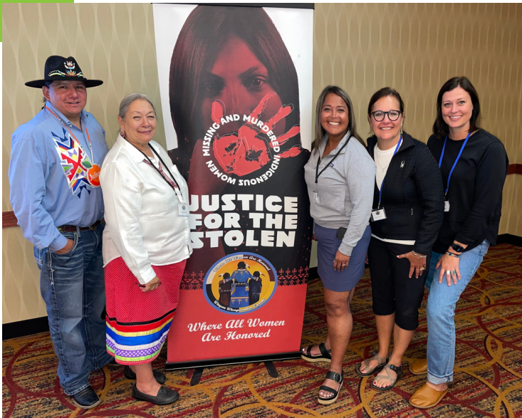
Above is a picture from the most recent MMIP conference in Deadwood, SD in May.

The FAST Tribal project continues to grow through partnerships with tribal partners and member agencies. FAST hosts a bi-weekly call to increase training, professional development, create space to share success, and advocate support. Part of the FAST Initiative was the creation of a crisis line. In partnership with the 211, the West River Human Trafficking Task Force, and Native Hope – the crisis line is now being expanded statewide as the Sex Trafficking and Sexual Assault Victim Hotline. The number is 1-888-352-8511 and will be listed on flyers and other informational documents being distributed in preparation of the Sturgis Bike Rallies.